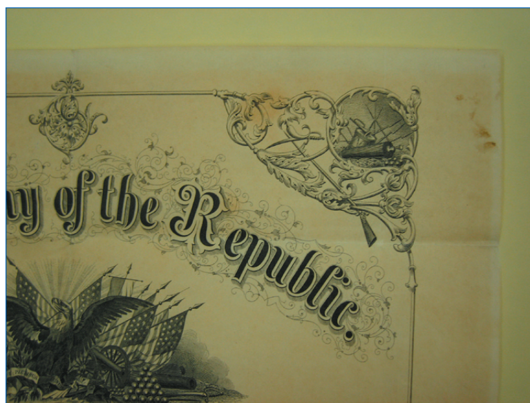
You can see the shading difference and the damage from being in a frame.

Don't forget to renew your Friends of the Indiana State Archives membership!